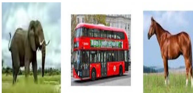
Fig. 4 Tested image

After obtaining all the necessary terms for a number of images in our database, the results were implemented in the final equation. The three images were selected from the database as shown in Figure 4.