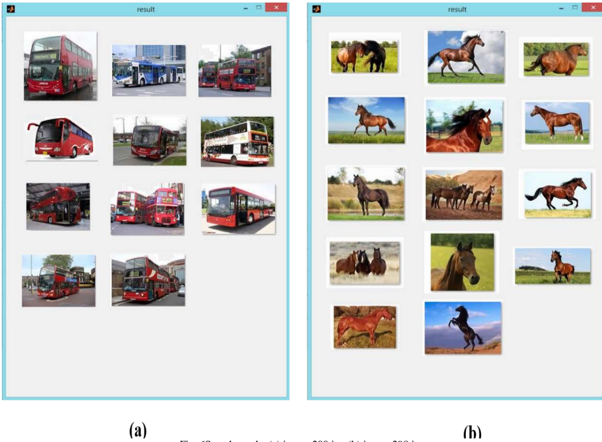
Fig. 6 Search results (a) image 200.jpg (b) image 298.jpg

query image and retrieved image. After this, a similar formula is applied on Bus image and Horse image as shown in Figure 6.