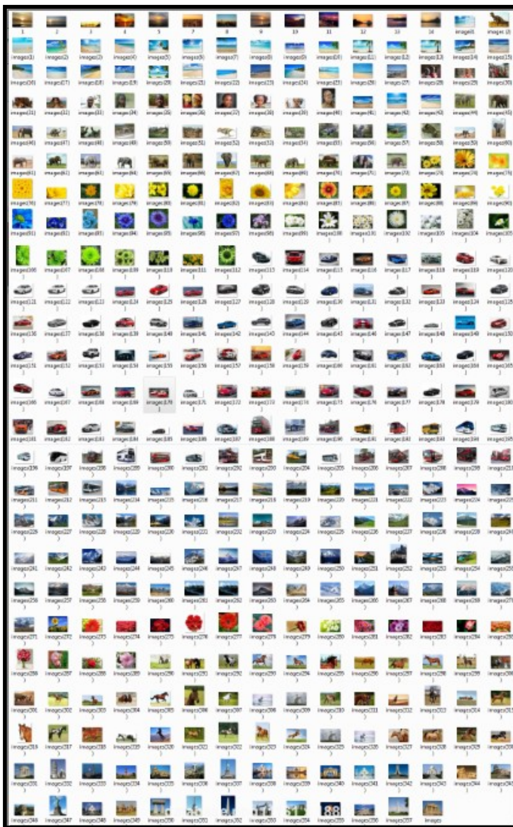
Fig. 2 Image Database