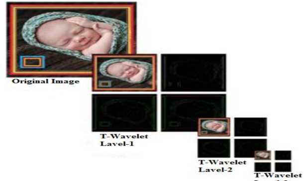
Fig. 1 Three Levels of T-Wavelet Pyramid [4]

where the T-Wavelet pyramid is applied. The levels of T-Wavelet are level-1, T-Wavelet level-2 and T-Wavelets level-3.