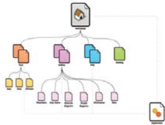
Fig. 9 General purpose sitemap

This is a simple page in our website containing the listing of the pages on our site, which displays the structure of our website in a hierarchical way. We should always make two sitemaps, one for users and other for search engines and make the sites easier to navigate. Sitemaps designed for visitors help visitors if they have problems finding the pages on a site & the sitemaps designed for search engines makes it easier for search engines to discover the pages of a site.