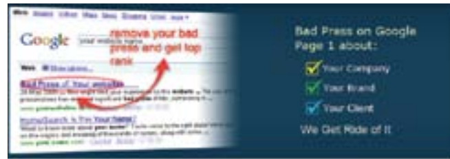
Fig.11 Reputation management in search engine optimisation

Search engine reputation management helps to move out of the first result pages those negative posts. It can help to bring back the good name, it helps in keeping business reputation preserved and protected. Each and every corner of the website is monitored and effective measures to protect a good reputation are taken. In brief this service takes effective measures to protect a good reputation and prevents other to damage the reputation.