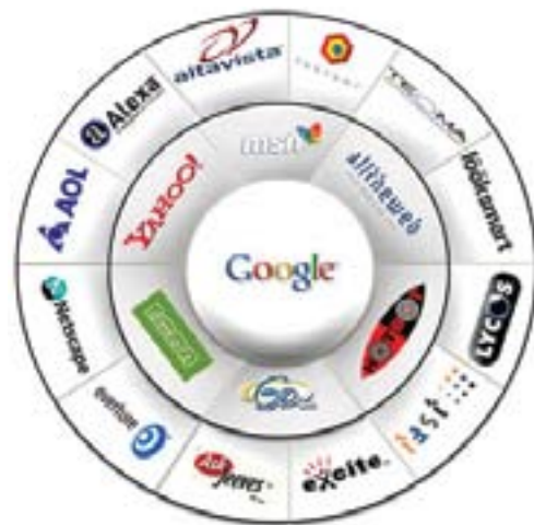
Fig.1 Search Engine Optimisation

It is the way of increasing the visibility of a page by natural means i.e., unpaid search results. In this process the website undergoes redevelopment to make our keywords effectively communicate with major search engines. This work is done by SEO (Search Engine Optimizers), They may target image search, academic search, local search, video search. Optimising a page involves editing contents & HTML codes in order to increase its relevance to specific keywords and proper indexing in search engines. The contents and codings are edited keeping in view of the indexing pattern of the search engines which are done by a crawler named Googlebot in Google. It is the most powerful way to reach to reach the customer as we meet them when they are in need. Most of the users find the target websites during their search.