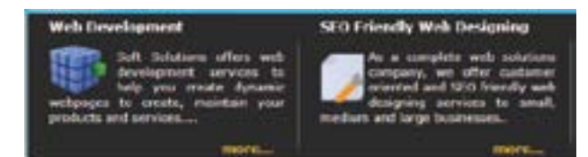
Fig. 5 Hyperlinks

A hyperlink is a navigation element or reference of a document in the other part of the same document, or a specified section of another document, that automatically brings the referred information to the user when the navigation element is selected by the user. The search engines basically predict that if we are linking something from our page is closely related to our page; In brief it makes the contents user-friendly if seen from the search engine point of view. Snapshot of a hyperlink is shown below.