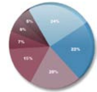
Fig. 13 Factors effecting SEO ranking