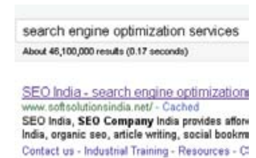
Fig. 4 Title optimisation

Following screenshot shows how search engine gives it relevance when fetching out user query.