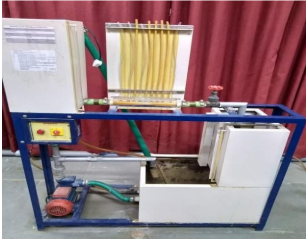
Fig. 1 Bernoulli's experimental test rig.

Inlet tank : Capacity 25 liters Stop watch : Digital Control panel comprises : Standard ON/OFF switch, Mains Indicator, etc.