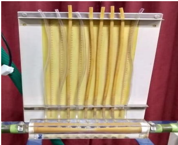
Fig. 2 Nine Piezometric tubes.