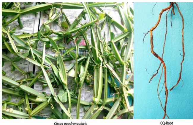
Fig. 1 Cissus quadrangularis Stem and Root

For this study we have chosen the plant Cissus quadrangularis (Fig. 1) which is commonly known as Veldt grape and conventionally used to treat bone related complications, obesity and gastrointestinal disorders. Though, there has been some preliminary reports about the medicinal properties of the CQ stem, the properties of the root are not yet discussed. Since we have planned to analyze the free radical scavenging and anti-inflammatory properties of both stem and root extracts of CQ through in vitro assays.